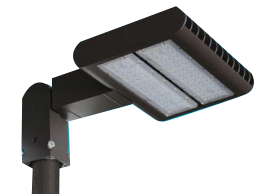
Shown with Slipfit Mount