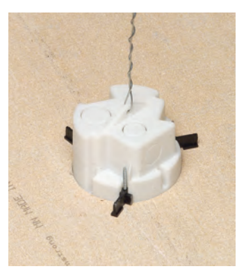
Attach drop wire to loop. Attach to framing member for 50 lb rating.