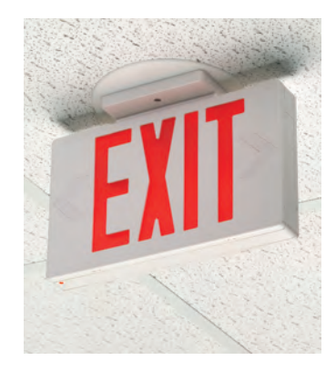
Finished installation on suspended ceiling. 50 lb rating with a drop wire. Secure, no sagging ceiling.