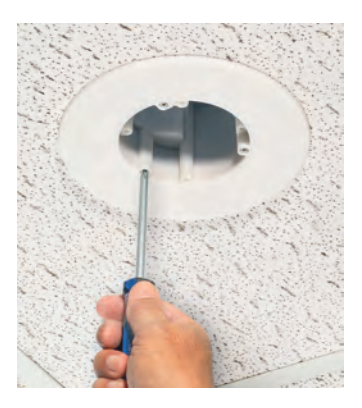
Align fixture as necessary. Tighten mounting wing screws.