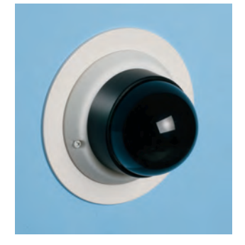
7 lb rating for walls...