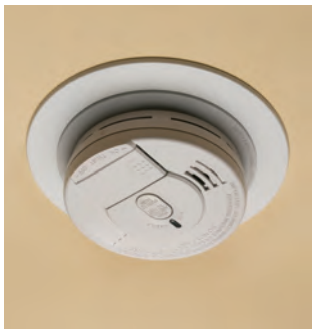
10 lb rating for drywall ceilings (without a drop wire)