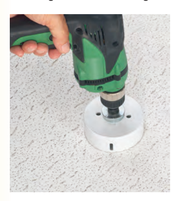
Cut hole in the desired location in the ceiling with a hole saw.

Installing a fixture with Arlington's CAM-LIGHT™ Box is quick, easy and secure.