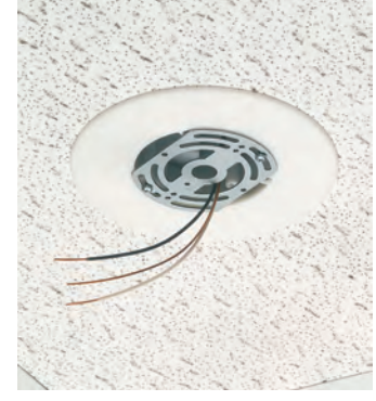
Ready for installation of fixture or detector.