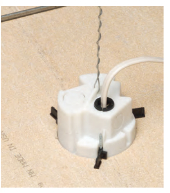
Choose the appropriate knockout (1/2" or 3/4"). Install supplied NM cable connector. Pull cable.