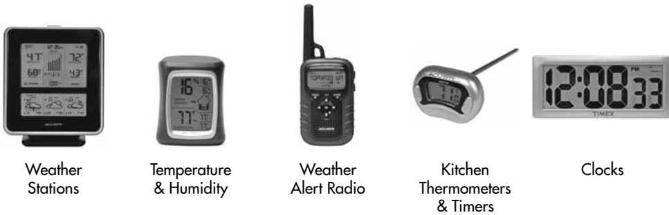
Weather Stations Temperature & Humidity Weather Alert Radio Kitchen Thermometers & Timers Clocks