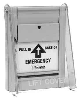
CM-721 (Show with optional lift cover)