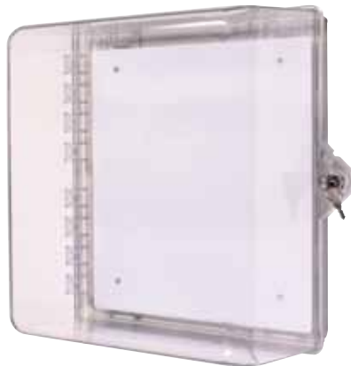
STI-7530 with Key Lock