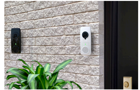
DB7 angle mount bracket